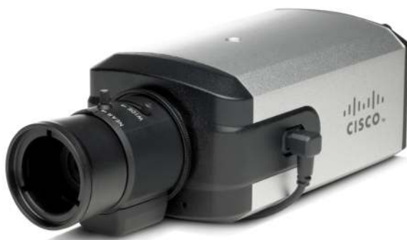
Figure 1. IP Camera Shown with Optional DC Auto Iris Lens, Available Separately

The Cisco Video Surveillance 4000 Series IP Camera offers a variety of benefits, including: